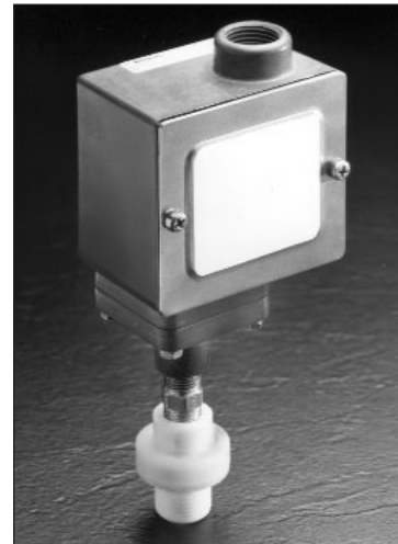
Suitable for a variety of pressure instruments

For filling Diaphragm Seals ordered without a gauge, fill liquid is available in 4 ounce bottles.